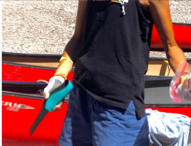
Examples of bathroom materials (top left), a period "go kit" (top right), and a pee funnel (bottom).

Privacy, or lack thereof: The landscape will influence the amount of privacy that you have. Working in a grassland or a desert might offer less privacy than a forest. No matter your bathroom situation, it is advisable to follow these rules.